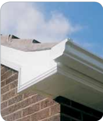
▲ Decorative Ogee style fascia boards in White finish