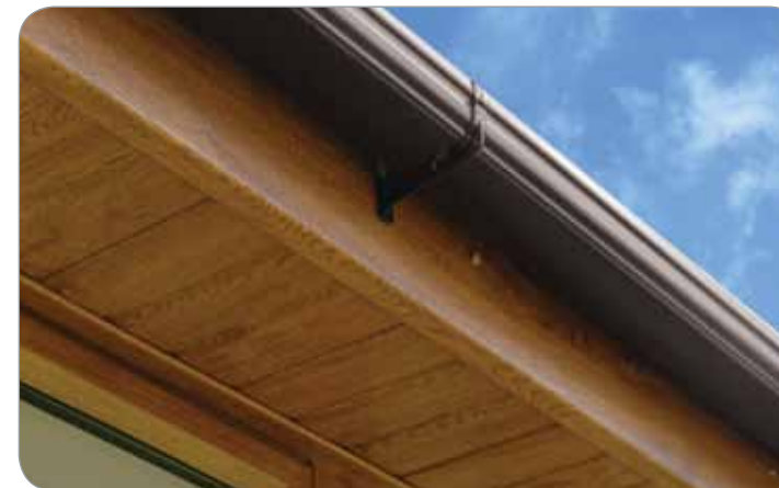
▲ Universal Plus guttering shown in Brown

Cream-coloured guttering is available exclusively from Eurocell in the Universal Plus style, while ogee styling gives you the option of a more decorative, sculpted finish.