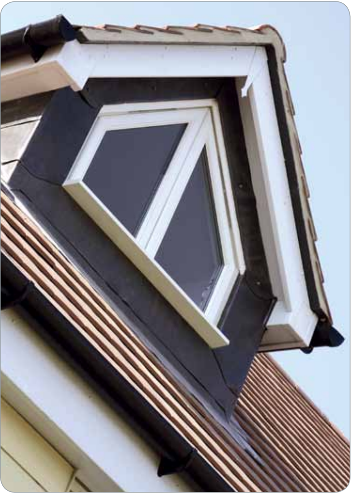
▲ Standard fascia boards and utility boards in White, featuring decorative finial

At 18mm thick, the boards are sturdy enough to be attached directly to rafters, helping to reduce the cost of fascia replacement. They are compatible with all types of soffit, giving you a choice of styles for your roofline.