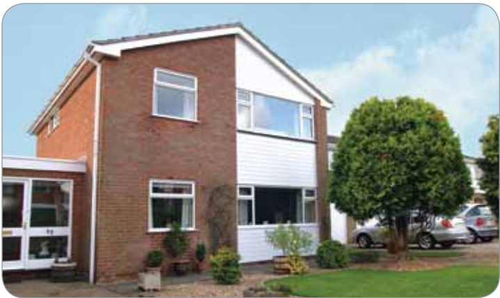
▲ Shiplap cladding in a horizontal formation, in White finish

In addition to these individually available items, there is a 3 in 1 solution (as shown above) which combines: A Over-fascia ventilation which sits underneath the felt tray, B Eaves comb filler and C In-built felt tray which prevents the roof felt from sagging and stops pools of water from forming.