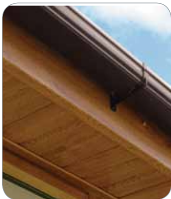
▲ Property with standard fascia boards in Golden Oak finish

PVC-U fascias, soffits and roof trims will brighten up your property, giving it a fresh new lease of life. All roofline products are available in a range of colours and woodgrain finishes to suit individual property styles and personal tastes. You can also choose plain flat boards for a simple, contemporary look, or sculpted ‘ogee’ style options for a more decorative finish.