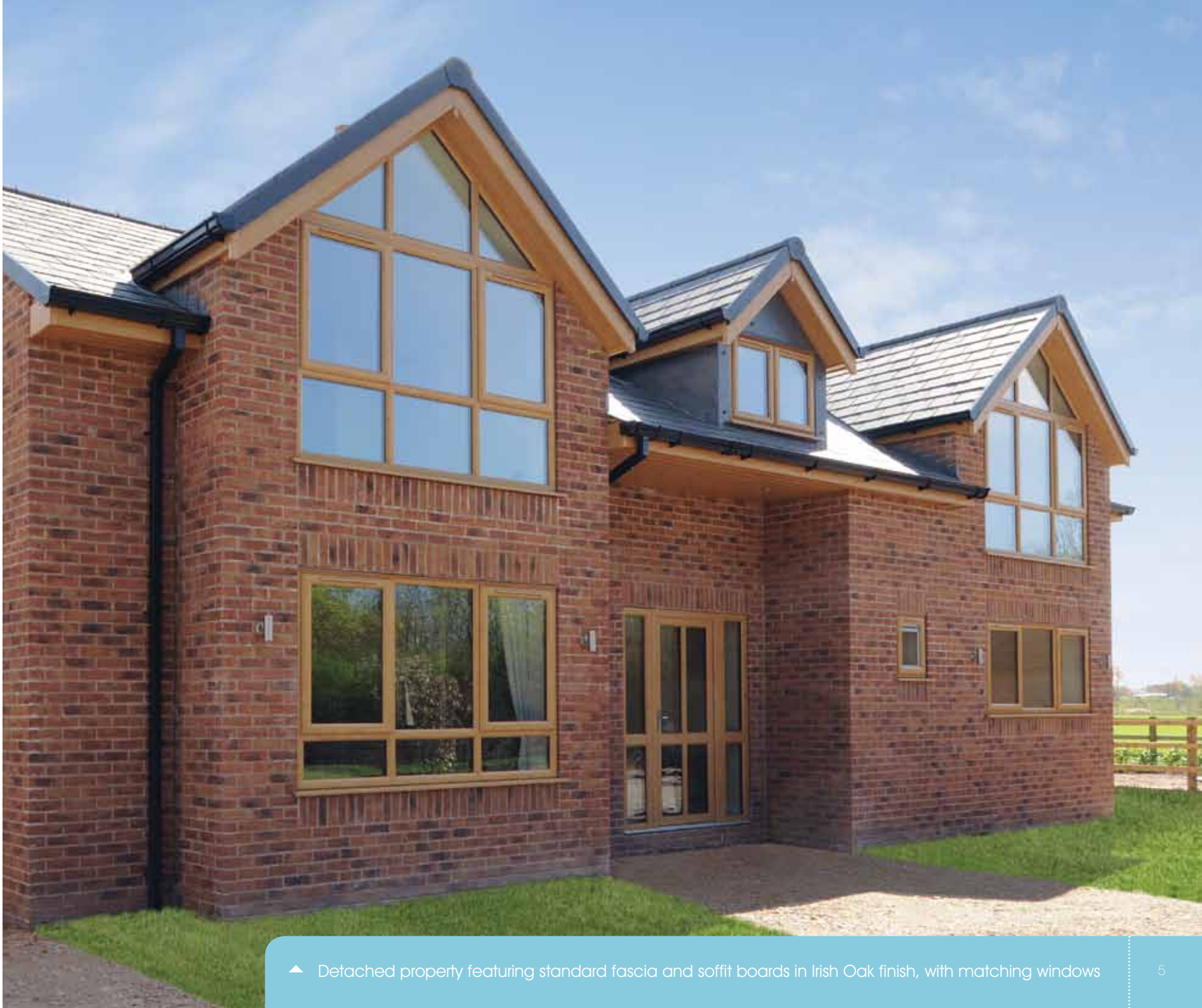
▲ Detached property featuring standard fascia and soffit boards in Irish Oak finish, with matching windows

White PVC-U roofline products come with a 20-year guarantee against discolouration, warping and cracking. Coloured, laminated boards carry a ten-year colour-fastness guarantee.