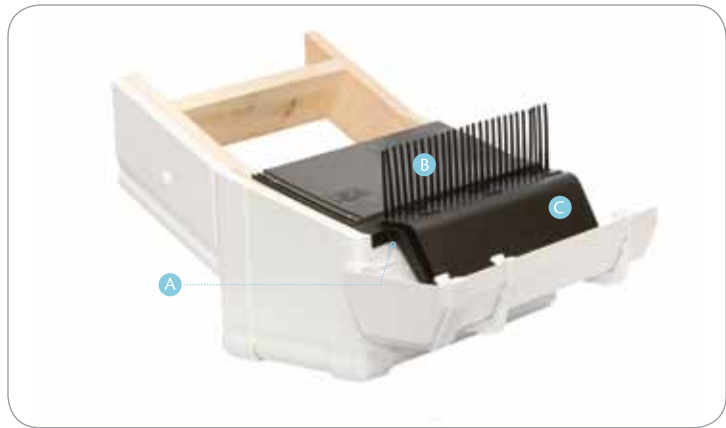
A roofline sample showing the 3 in 1 accessory used to enhance your roofline solution ▲