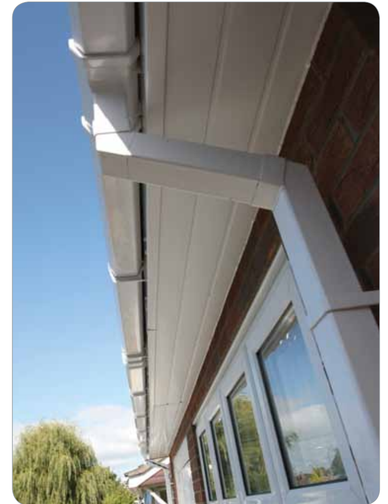
▲ Square-line guttering shown in White