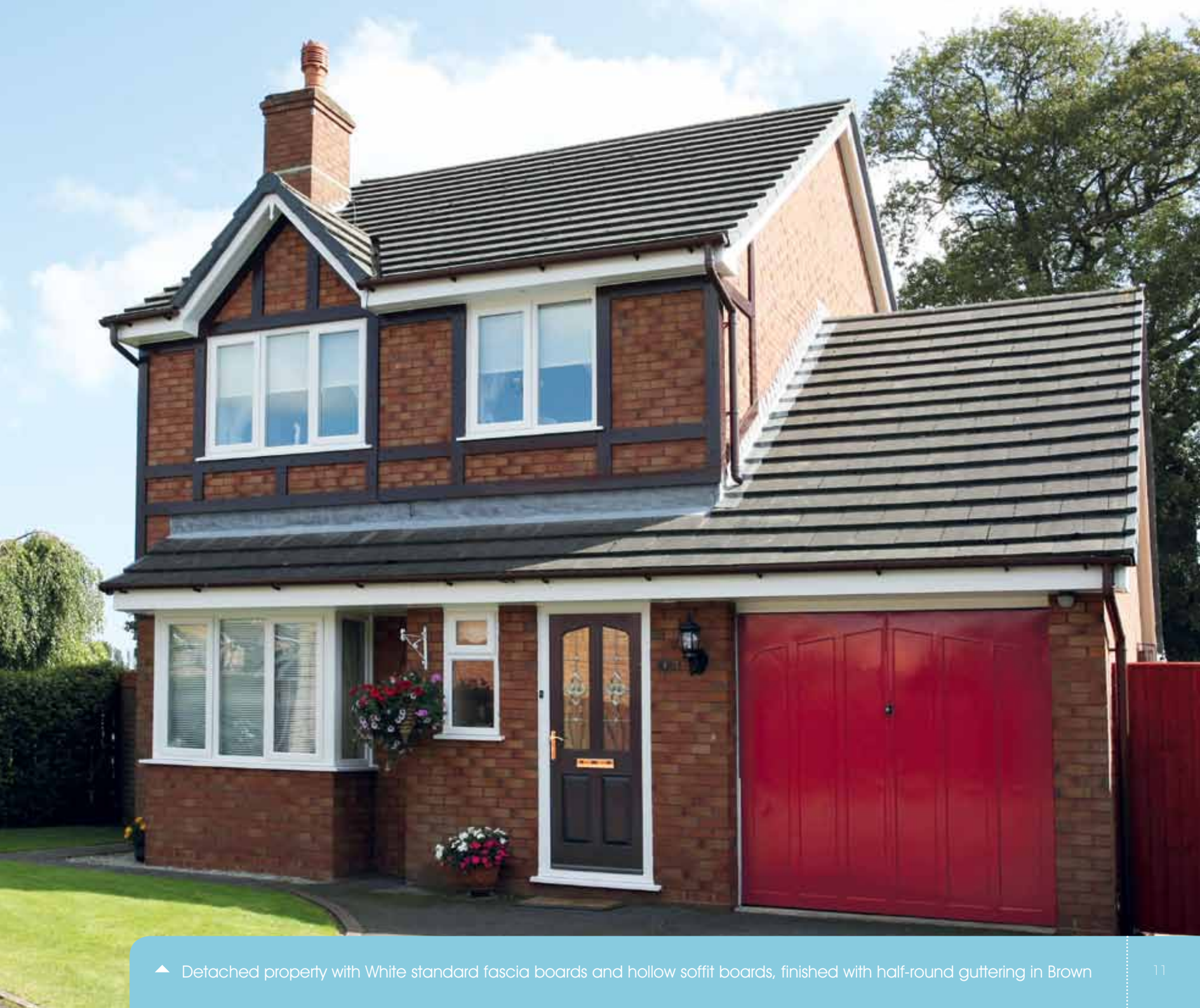
▲ Detached property with White standard fascia boards and hollow soffit boards, finished with half-round guttering in Brown