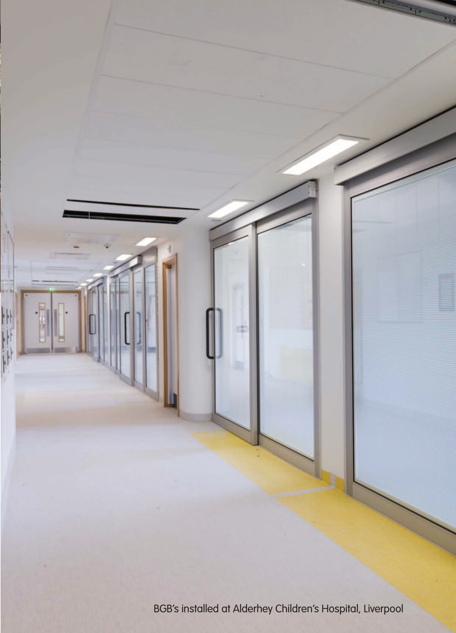
BGB's installed at Alderhey Children's Hospital, Liverpool